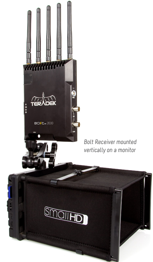
Bolt Receiver mounted vertically on a monitor