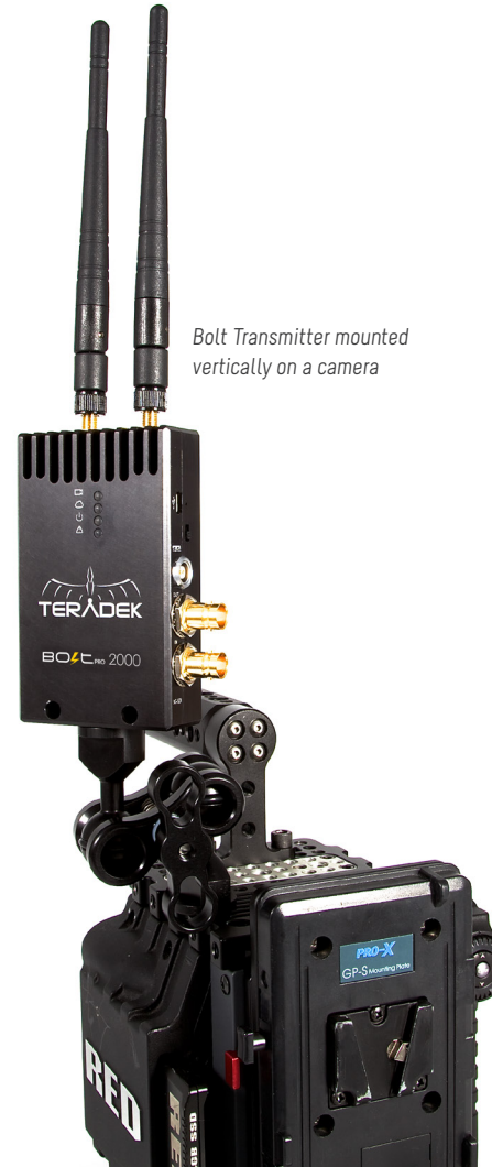
Bolt Transmitter mounted vertically on a camera